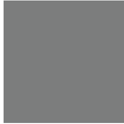
275 Light Gray