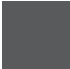
276 Medium Gray