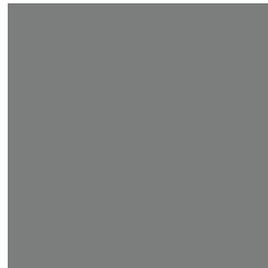
275 Light Gray