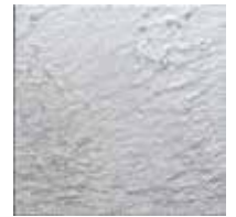
Metallic Silver SC-133