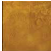
Peanut Butter SC-113