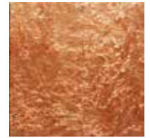
Metallic Bronze SC-132