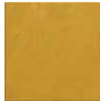
Brown Sugar SC-108