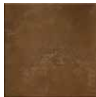
Milk Chocolate SC-119