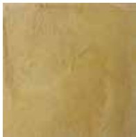
Quayle Potatoe SC-107