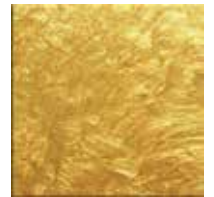
Metallic Gold SC-134