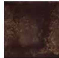
Coffee Bean SC-131