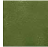
Poppy Seed SC-105